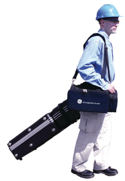
TransPort PT878GC portable flowmeter and accessories

The new meter was tested extensively on metal pipes with diameters as small as 0.75 inches and as large as 24 inches. This meter is suitable for measuring the flow of air, hydrogen, natural gas and many other gases.