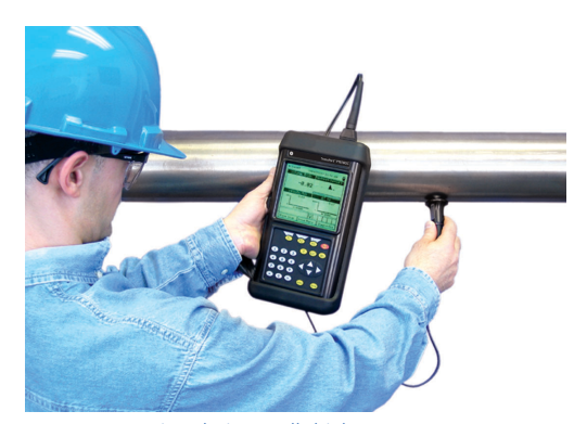
Optional pipe wall thickness gauge

Pipe wall thickness is a critical parameter used by the TransPort PT878GC flowmeter for clamp-on flow measurements. The thickness-gauge option allows accurate wall thickness measurement from outside the pipe.