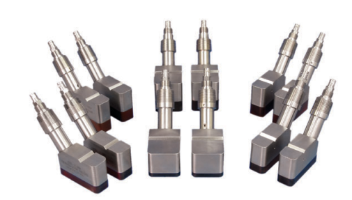
GE's technologically advanced clamp-on gas ultrasonic transducers

The new line of clamp-on gas transducers produces signals that are five to ten times more powerful than those of traditional ultrasonic transducers. The new transducers produce clean, coded signals with very minimal background noise. The result is that the TransPort PT878GC flowmeter system performs well even with low-density gas applications.